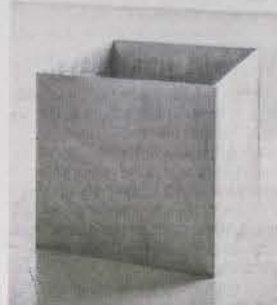
Installation view of 'Charles Ray: Figure Ground,' left; Mr. Ray's '81 x 83 x 85 = 86 x 83 x 85' (1989), above; and 'Tractor' (2005), below