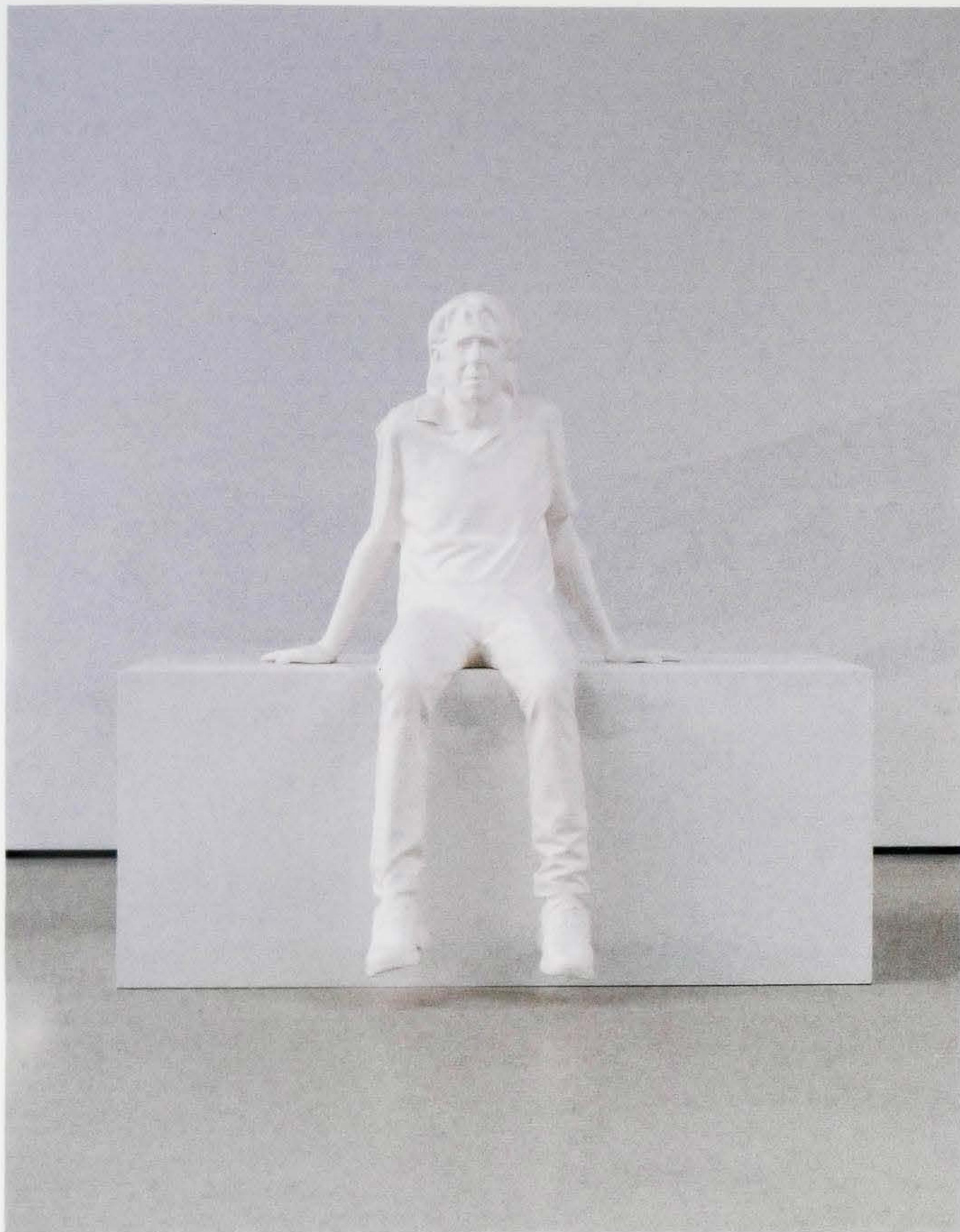
Return to the one , 2020, handmade paper, 59½ by 63 by 55½ inches.