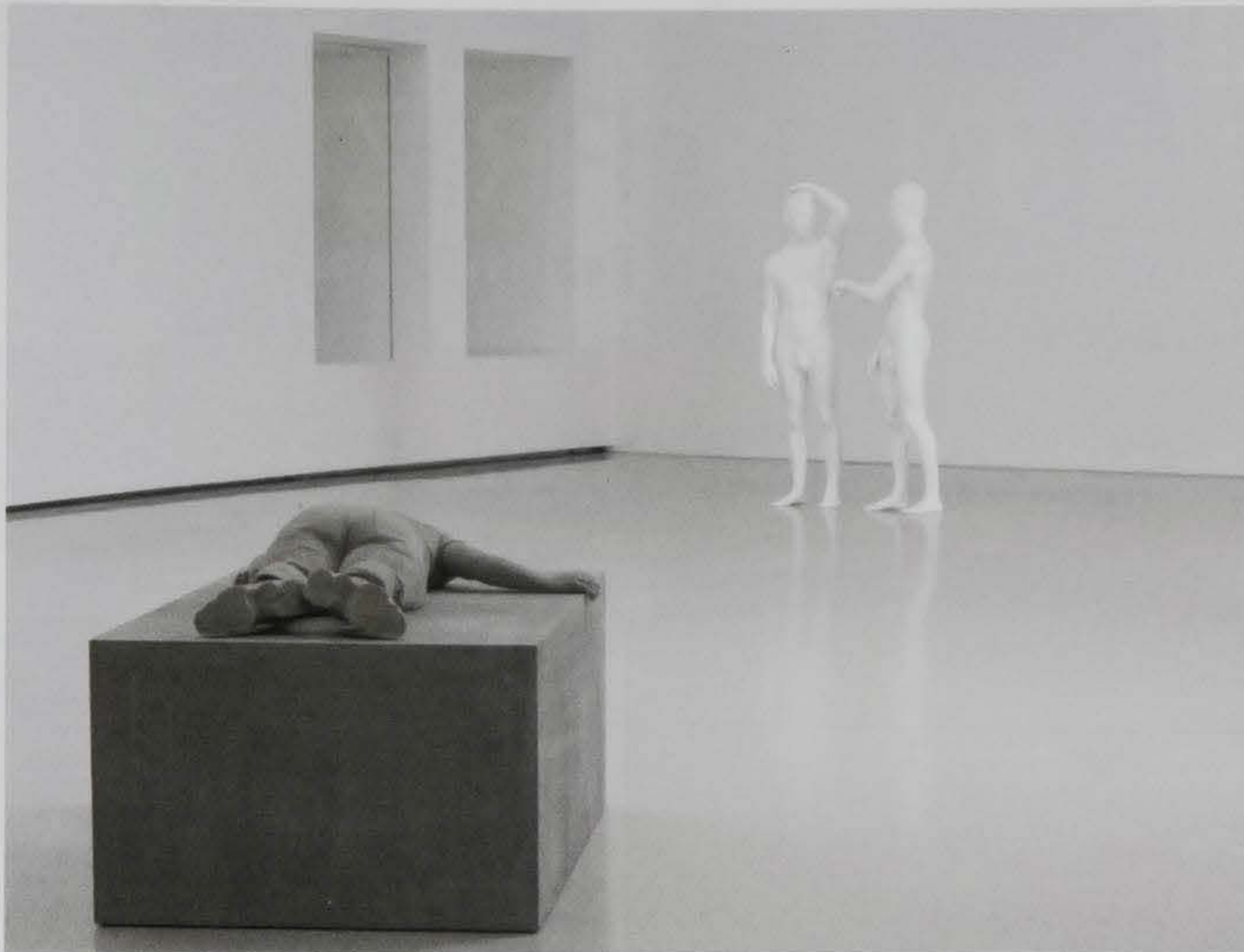
Left, Concrete Dwarf , 2021, cement, and right, Doubting Thomas , 2021, painted carbon fiber.