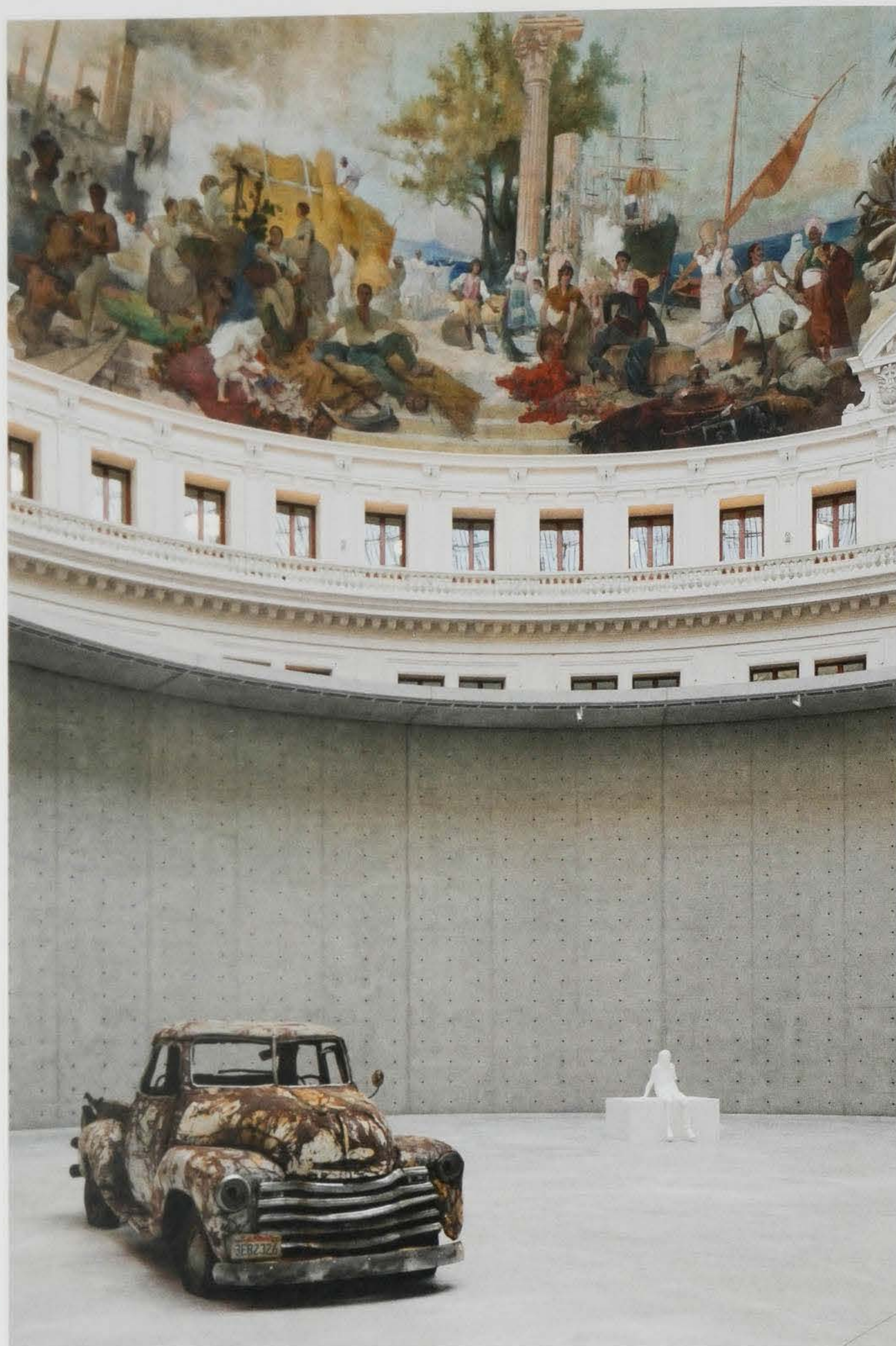
View of Ray's exhibition at the Bourse de Commerce, Paris, showing (left) Unbaled Truck , 2021, 1948 Chevy truck, and right, Return to the one , 2020, handmade paper.

monumental recumbent nude depicted in Portrait of the Artist's Mother (2021) pleasures herself with her left hand, while Self-Portrait (1990) depicts a young Ray in sailing attire, looking poised to walk off.