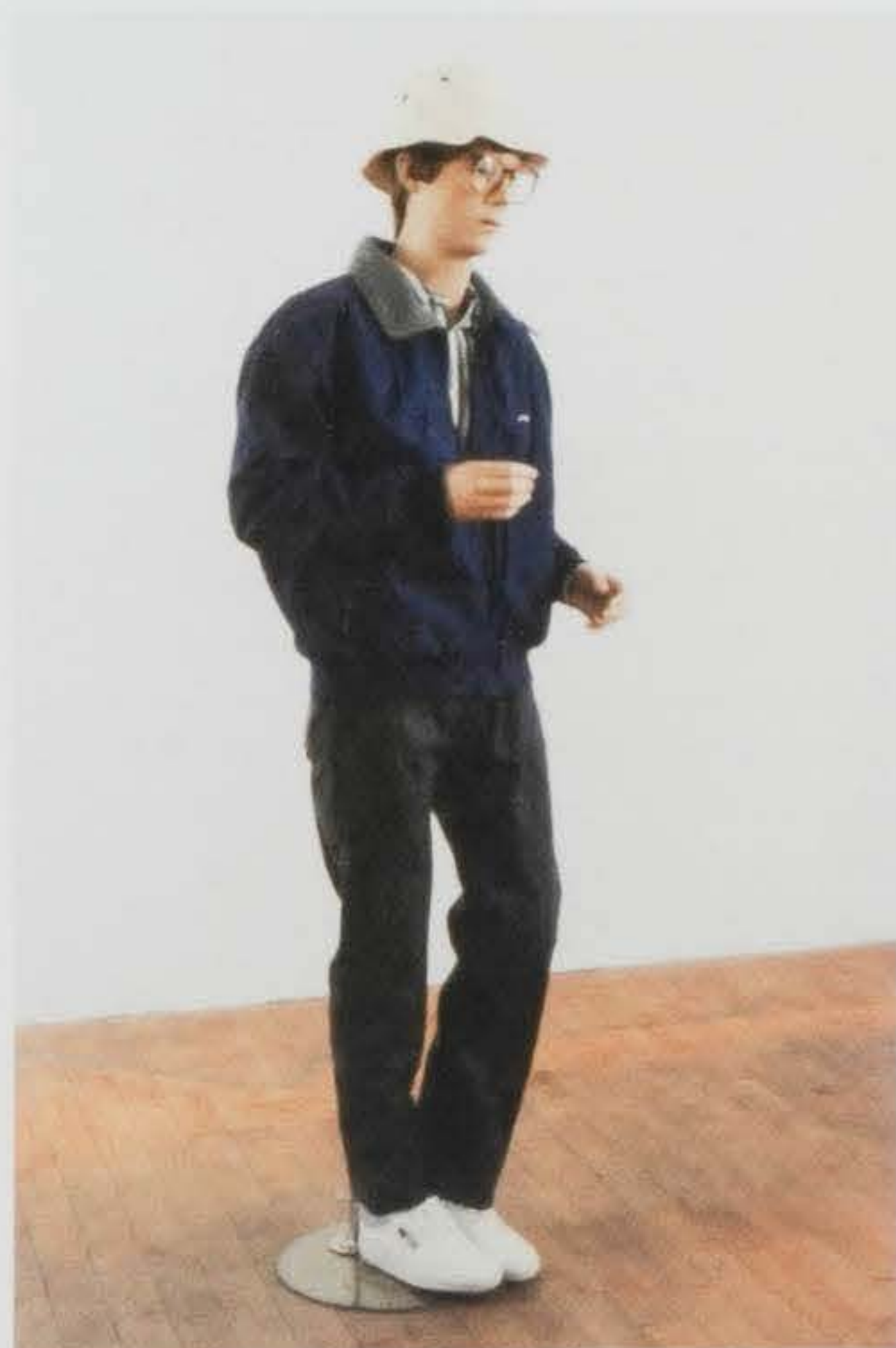
Self-portrait , 1990, painted fiberglass, clothing, glasses, synthetic hair, glass, and metal, 75 by 26 by 20 inches.

Many lenders to the Pompidou show required their works to be physically inaccessible. Ray responded by constructing two large, low-walled, square-columned enclosures that visitors can circumambulate, and a third where they get a limited view of three pieces – a cot on which a figure lies, a table, and a bottle. Only five sculptures are approachable. In one enclosure, Ray suggests narrative linkages among four works. There's a rumpled death car rendered in gray-painted fiberglass – Unpainted Sculpture (1997) – and nearby on the floor lies Clothes Pile (2020), a finely detailed aluminum casting of rumpled clothes, painted white. Two figures face away from each other: the