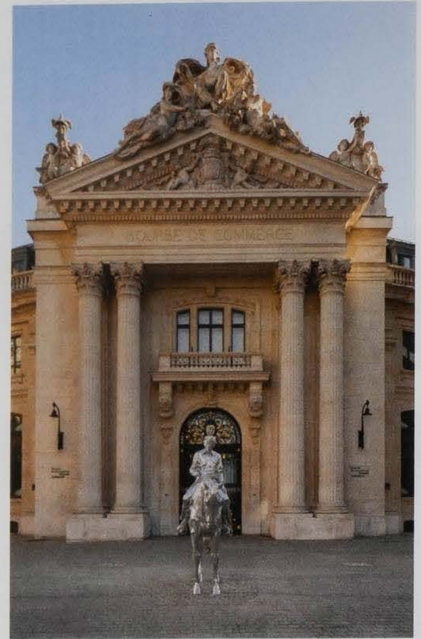
Horse and Rider , 2014, stainless steel, approx. 9 by 3 by 9 feet.

psychology: the kid in his own bubble, playing with his car; the aging artist and the old truck, conveying mileage.