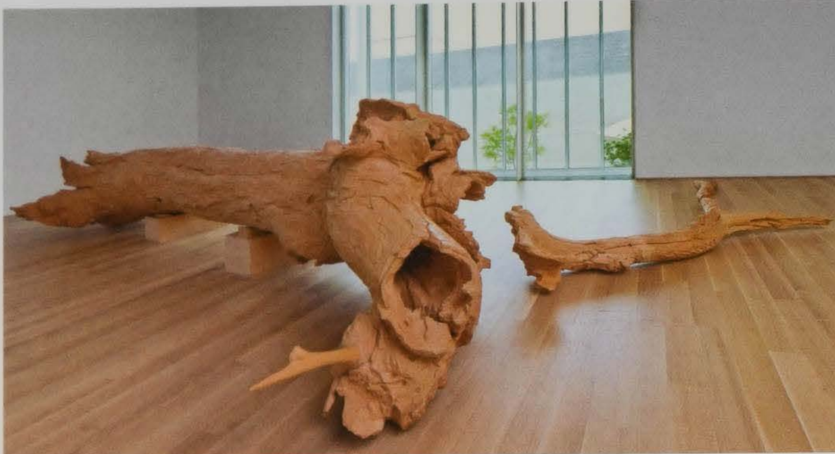
Hinoki , 2007, cypress wood, approx. 5½ by 32 by 20 feet.

BETWEEN 1977 AND 1985, RAY COMPLETED nineteen pieces that are well documented in photographs but listed as "destroyed" in the "Catalog of Works, 1971–2021" in the