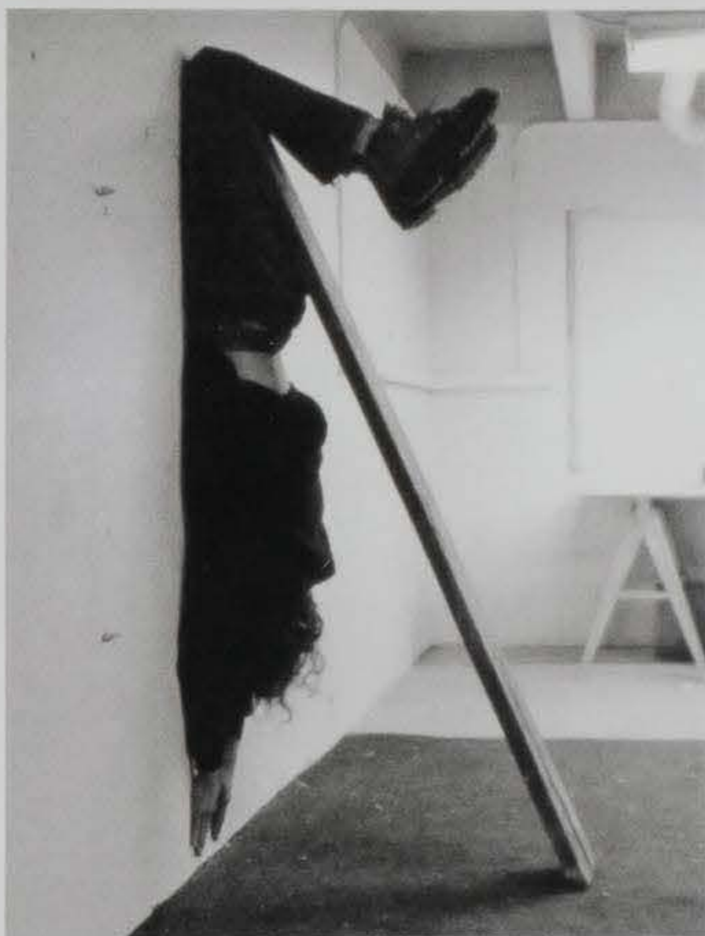
Above, Plank Piece I-II , 1973, two black-and-white photographs, 39½ by 27 inches each.

These ephemeral actions cheekily allude to Richard Serra's Prop (1968), a cylinder of rolled lead sheeting pressing a five-foot-square lead sheet to the wall. Ray's reply is physically lighter but psychologically heavier, and almost all that's to come in the artist's oeuvre is present here: ambition, the body as subject, dark humor, activated space, riffs on sculptural history.