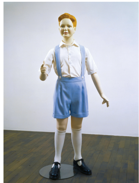
Whitney Museum of American Art, New York/Charles Ray/Courtesy of Matthew Marks Gallery, New York and Los Angeles; photograph by Reto Pedrini

Around 2000 Ray shifted from polychrome fiberglass mannequins with meticulous surface details—clothing, eye color, etc.—to using 3D digital scans and other technology to make unpainted figures cast and carved from metal and wood. Whereas the mannequins had been funny, alarming, or provocative, the works in metal are stately and reserved, almost elegiac. They are clearly modeled on specific people chosen as representative types rather than distortions of commercial imagery, with an accompanying shift in tone to a more mature gravitas.