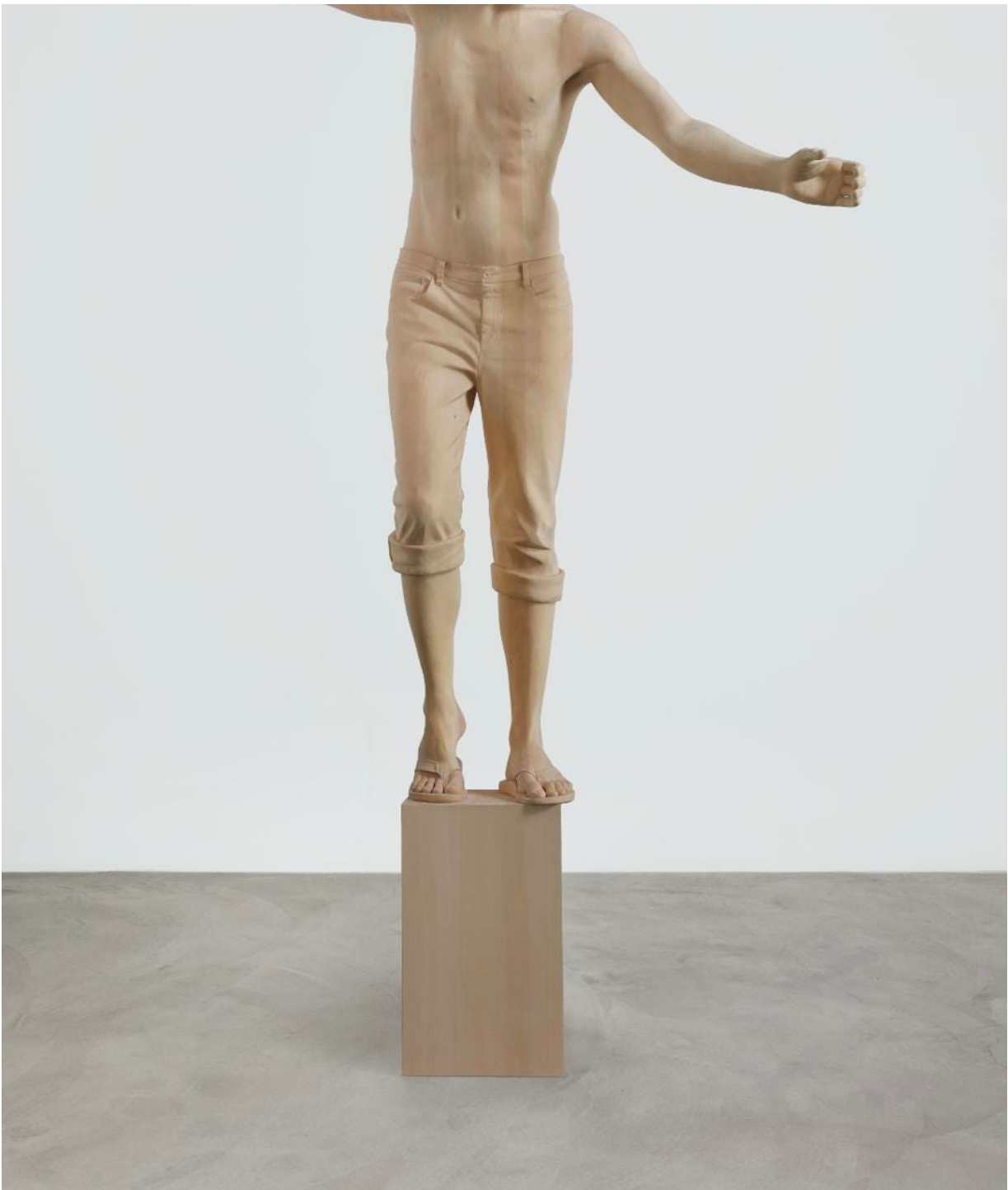
Archangel, 2021. Cypress. 13 ft. 5 1/2 in. × 89 1/2 in. × 45 1/2 in. Collection of the artist, ... [+] TAKERU KORODA

Currently on view at the Metropolitan Museum of Art, standing on an integral pedestal that puts flip-flops at eye level, Archangel bears no trace of the context that inspired it. Ray has even eliminated the sword wielded by his model in reference to the biblical archetype. In the seven years he took to realize his version of Gabriel in hand-carved cypress, all but the essential has been chiseled away to express a moment of heavenly visitation.