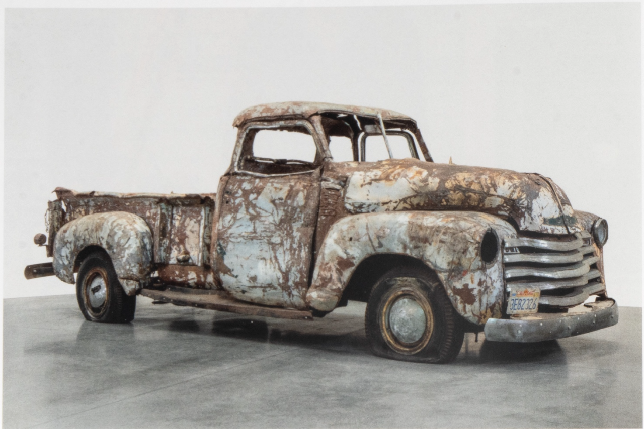
2. Unbaled Truck , 2021, Charles Ray, crushed 1948 Chevy, 193 x 183 x 528 cm; 1,044 kg

Photo: Josh White; courtesy Matthew Marks Gallery. © Charles Ray