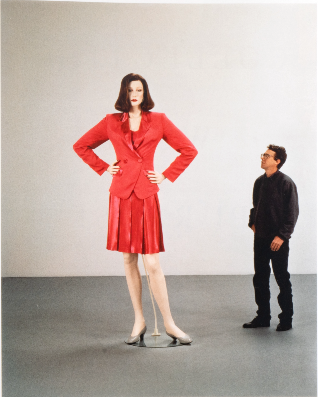
4. Fall '91 , 1992, Charles Ray, painted fibreglass, synthetic hair, clothing, jewellery, glass, metal, ht 243.8cm