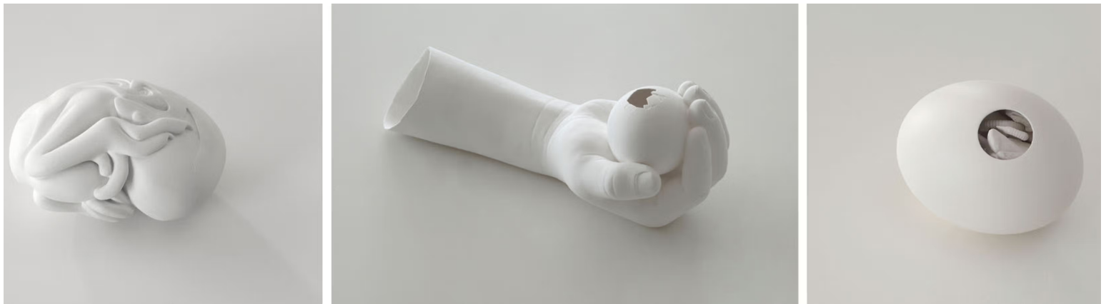
Charles Ray (American, b. 1953). Handheld bird , 2006. Painted stainless steel, 2 × 4 × 3 (5.1 × 10.2 × 7.6 cm). Matthew Marks Gallery Charles Ray (American, b. 1953). Hand holding egg , 2007. Porcelain, 3 × 8 × 3 in. (7.6 × 20.3 × 9.5 cm). Matthew Marks Gallery Charles Ray (American, b. 1953). Chicken , 2007. Painted stainless steel and porcelain, 1 × 2 × 1 (4.4 × 5.7 × 4.4 cm). Glenstone Museum of Art, Potomac, Maryland.

It's not the themes themselves I'm resistant to; I'm resistant to focusing on themes. Themes are like forms—meaning develops from how they are shaped. When you turn the corner from No (1992), you see the three small sculptures. What about them? Birth, death. Handheld bird (2006) and Hand holding egg (2007) were studies for Chicken (2007). In Chicken everything centered on making the hole in the egg. The chick is complete inside the egg, but I think the sculpture dissolves in and around the hole. The mathematical definition of a hole is an object that can't be shrunk to a point.