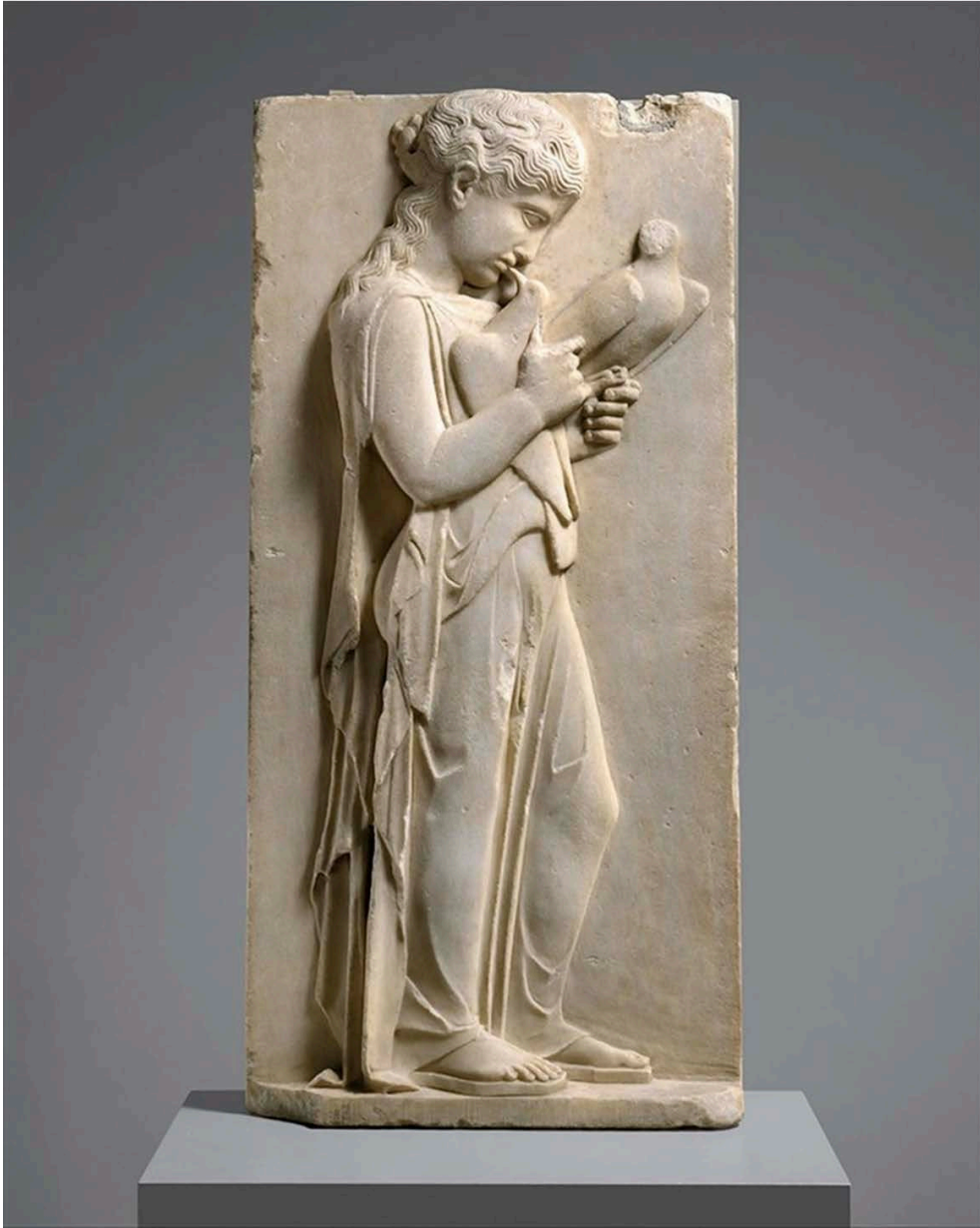
Marble grave stele of a little girl , ca. 450–440 B.C. Greek, Classical. Marble, Parian, height: 31 3/4 in. (80.6 cm); width (top): 14 9/16 in. (37 cm); width (base): 15 1/2 × 4 in., 131 lb. (39.4 × 10.2 cm, 59.4 kg). The Metropolitan Museum of Art, New York, Fletcher Fund, 1927 (27.45)

What about other allusions in your work to historical art, implicit and otherwise? There's a long history of figuration that your sculpture carries