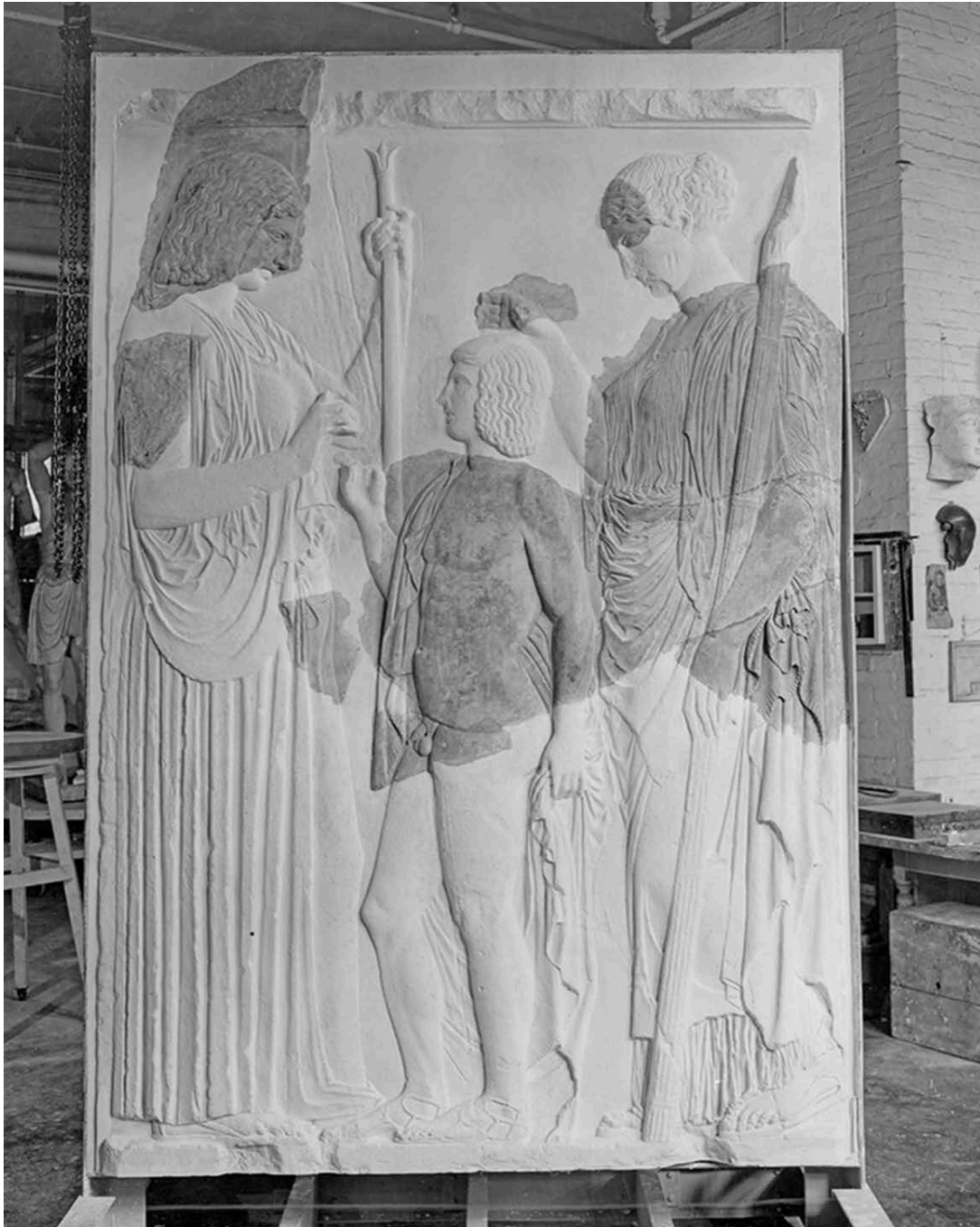
Archival photograph from May 1935 showing the ten marble fragments from the Roman copy, which appear in dark gray, recently set into a cast of the original Greek relief, which appears in light gray.

On the one hand, your sculpture is perfect—thought through, deeply felt, expertly engineered and executed. On the other hand, it's complex, hybrid, composite physically. Composite culturally, too, so to speak. And that can