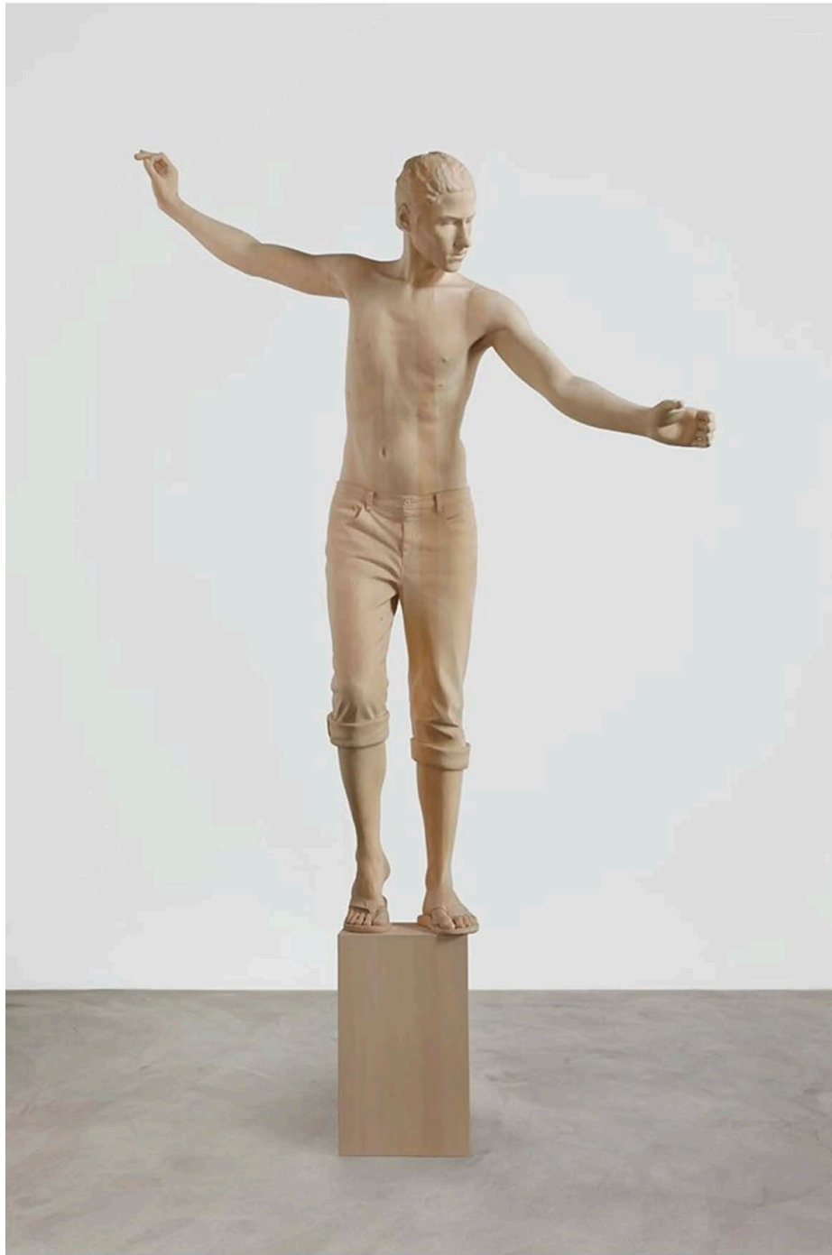
Charles Ray (American, b. 1953). Archangel , 2021. Cypress, 13 ft. 5 in. x 89 in. x 45 in. (410.2 × 227.3 × 115.6 cm). Collection of the artist, courtesy Matthew Marks Gallery. ©

Charles Ray, Courtesy Matthew Marks Gallery