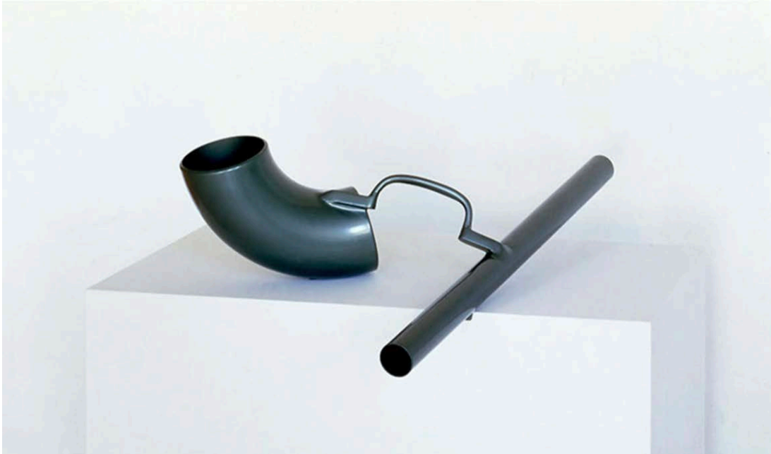
Anthony Caro (British, 1924–2013). Table Piece XXII, 1967. Painted steel, 10 × 31 ½ in. (25.4 × 80 × 68.6 cm). Caro Family Collection.