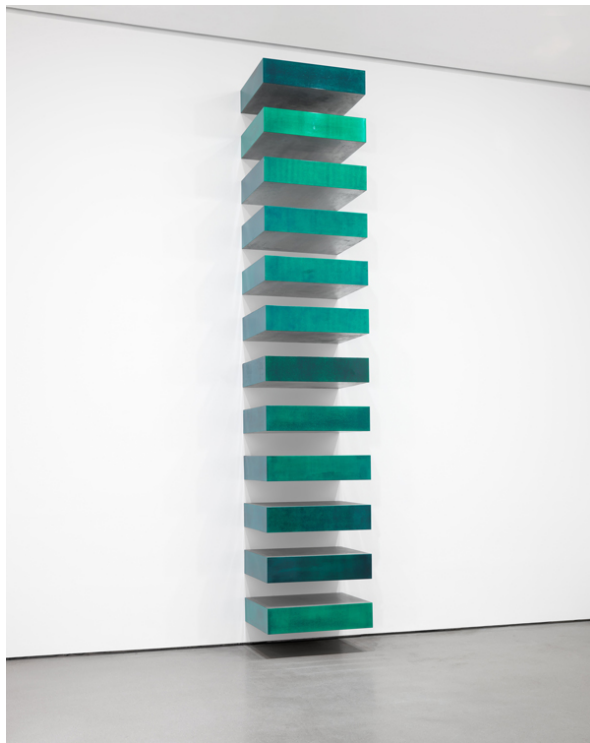
Donald Judd, Untitled (Stack), 1967, lacquer on galvanized iron, 12 units, each 9 x 40 x 31", The Museum of Modern Art, NY

but objects . Shortly after Judd's article was published, critic Lucy R. Lippard organized the exhibition "Eccentric Abstraction," which included, among others, Eva Hesse, Louise Bourgeois and Bruce Nauman. Her catalog text emphasized the "nonsculptural" quality of their three-dimensional objects, describing conventional sculpture as an "apparent dead end." None of this is to suggest that traditional sculpture wasn't still being made by Anthony Caro, Mark di Suvero and many others. It is to say that the sculptural idiom, as old as art itself, was exhausted and obsolete.