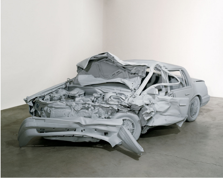
Charles Ray, Unpainted Sculpture, 1997, 60 x 78 x 171", fiberglass, paint, collection Walker Art Center.

The “death of painting” is frequently traced to the work and writing of Donald Judd. In 1965’s “Specific Objects,” the same essay in which Judd outlined painting’s limitations—above all, its inherent illusionism—he even more forcefully predicted the death of sculpture. Describing sculpture at the time as a “set form” or “a certain kind of form,” he wrote, “it can probably be only what it is now—which means that if it changes a great deal it will be something else, so it’s finished.” He adamantly maintained that his own works, and those by such fellow artists as Dan Flavin, Robert Rauschenberg and Claes Oldenburg, were not sculptures