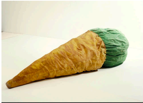
Floor Cone (Giant Ice-Cream Cone), 1962.

they were presented. Occupied by the powerful presence of a simple volume like a box, plank, or slab and a kinesthetically alert beholder, the room's charged space is part of the artwork and the experience.