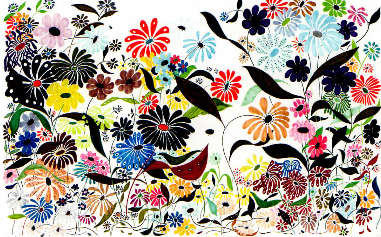
Untitled, 2003, ink on paper, 26 x 40 inches, photography courtesy of Art Institute of Chicago

Chicago. The real driving force of my work is formal constructivism.