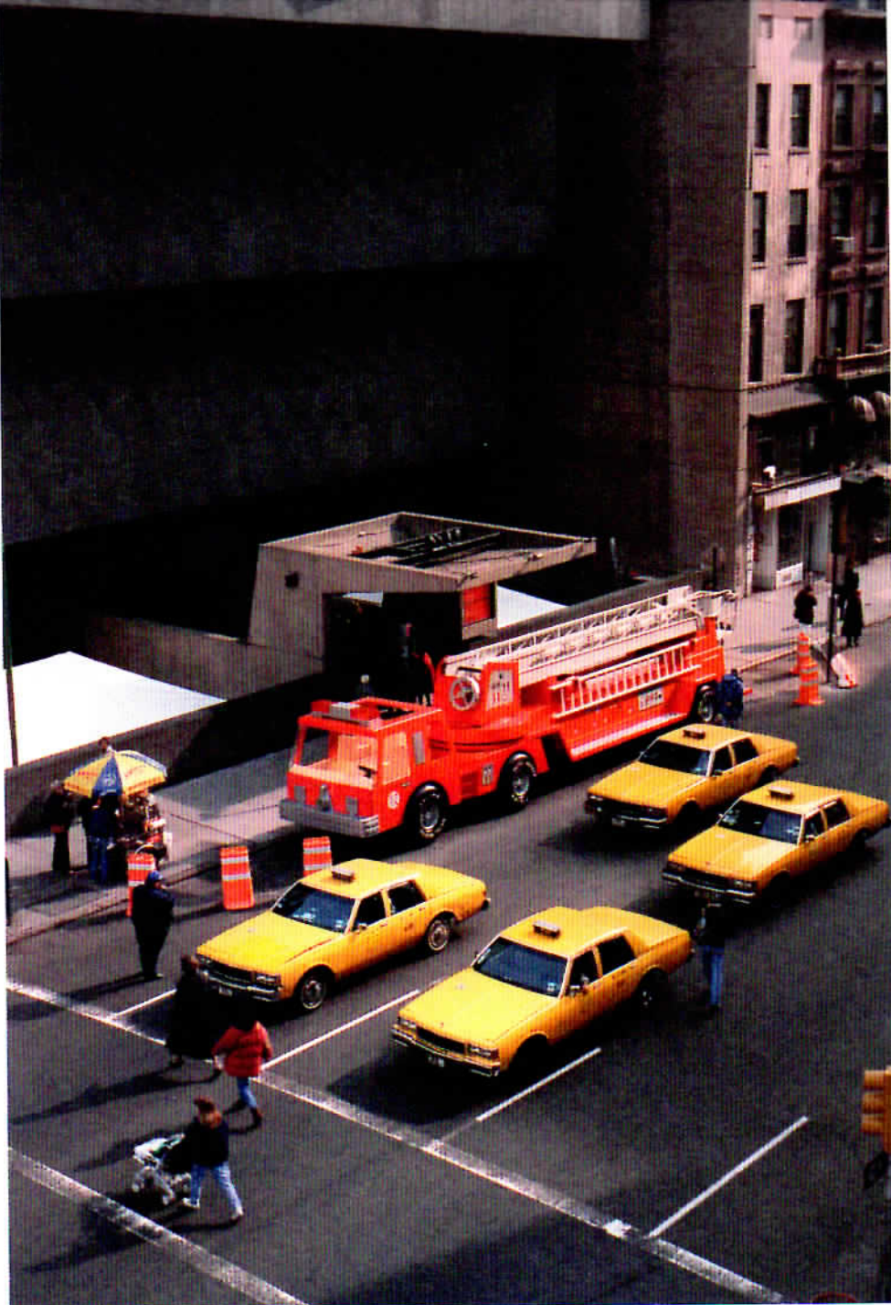
Firetruck , 1993, painted aluminum, fiberglass, and plexiglass, 12 x 8 x 46 1/2 feet

CHARLES RAY — No. I wouldn't want to be young again, not for anything. There's a real beauty in not reliving things, but to