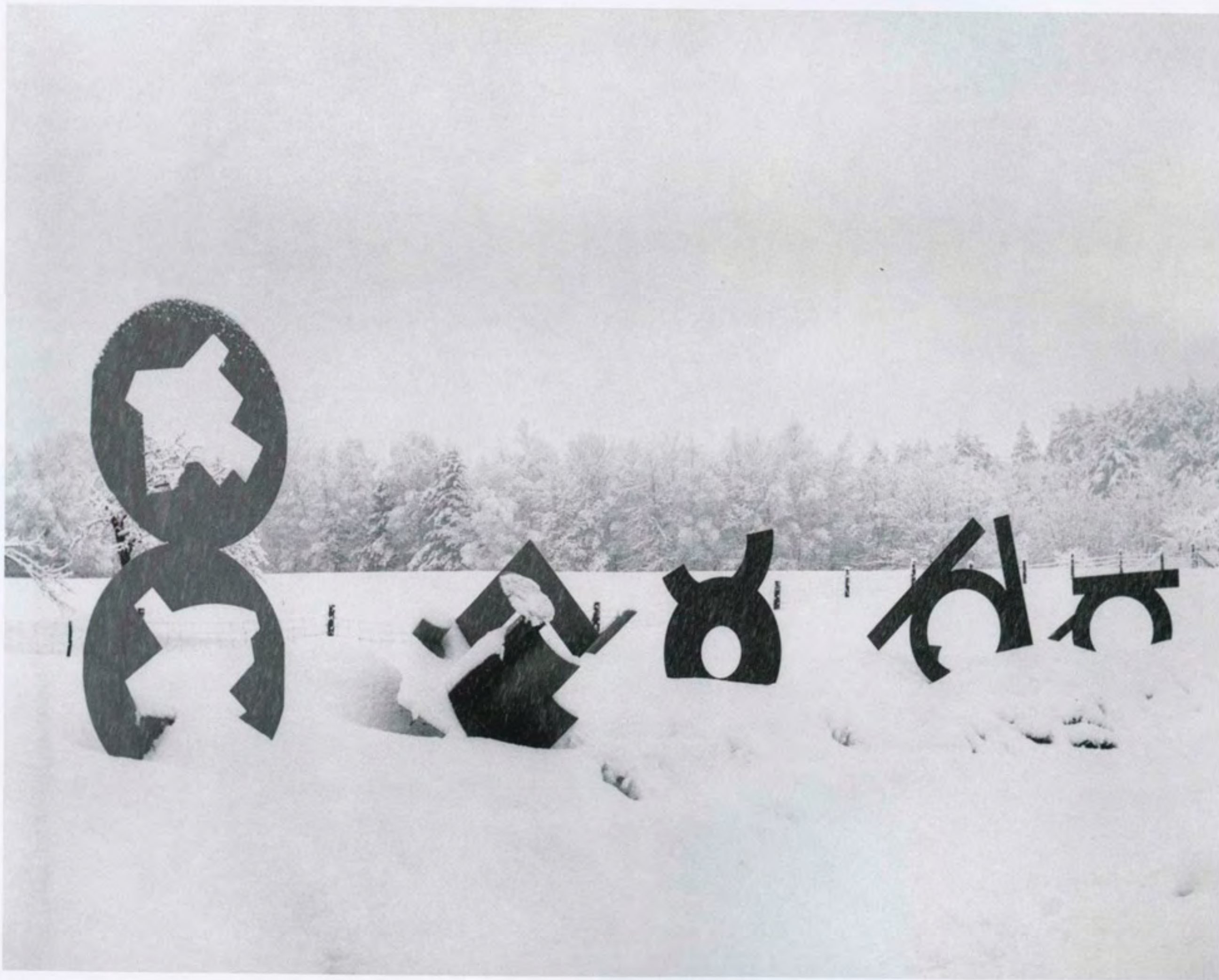
Figure 15 Sculpture group by David Smith (American, 1906–1965), including Circles III, II, and I (all 1962), Bolton Landing.