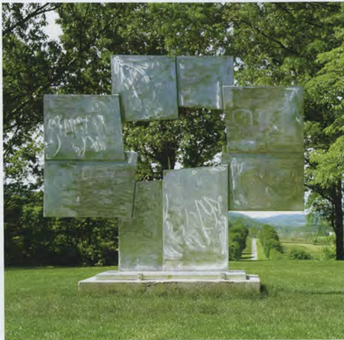
Figure 21 David Smith, Untitled (Candida) , 1965. Stainless steel, 103 × 120 × 31 in. (261.6 × 304.8 × 78.7 cm). The Estate of David Smith

when we are not. This brings me to the story of certain sculptures that find a way to remain as objects when other artifacts are long lost or have disintegrated. With time, sculpture sheds its ideas, and what is left is what the artist made. How do certain works enter time while others die when we forget the purposes they originally served?