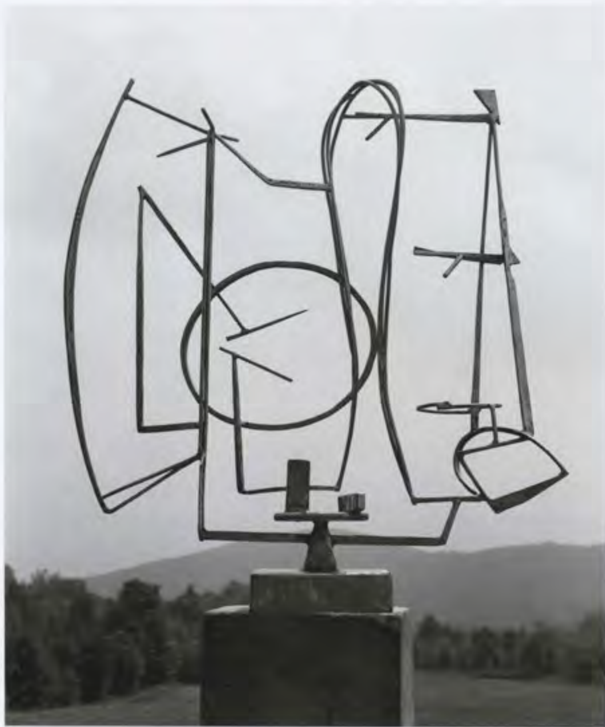
Figure 20 David Smith, Stainless Window , 1951, Bolton Landing. Stainless steel, 31½ × 27 × 6 in. (80 × 68.6 × 15.2 cm). The Estate of David Smith.

reference to the Adirondacks than to elements of landscape. Steel bars and end cuts and other industrial scrap magically become like clay. Each element is extruded through Smith's hand, yet simultaneously forged by industry. The work acquires energy from the sculptural thought and touch of the artist's intentionality. If the title Australia refers to the springy kangaroo emerging from