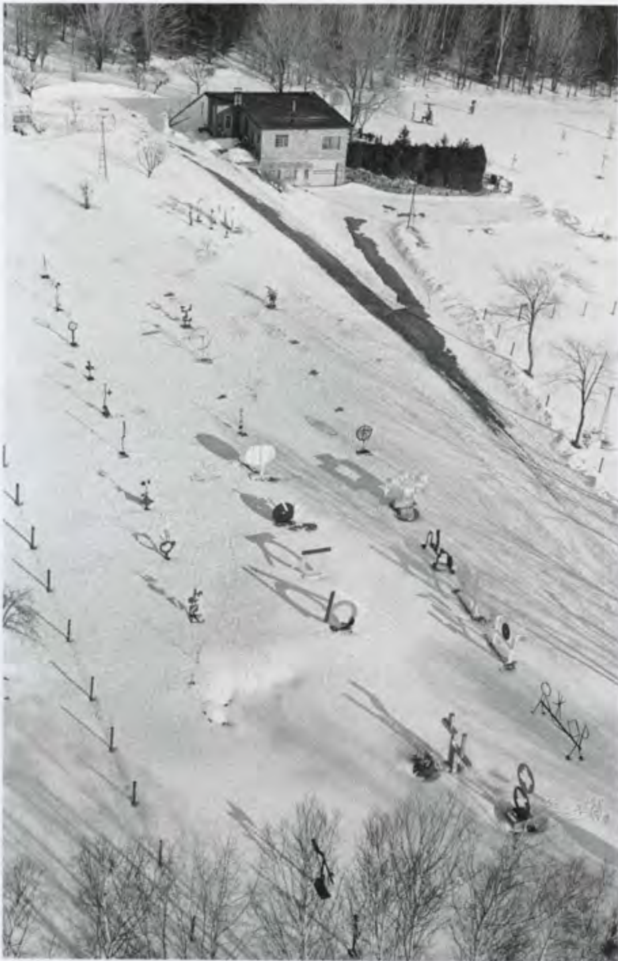
Figure 18 North Field at Bolton Landing, c. 1967.