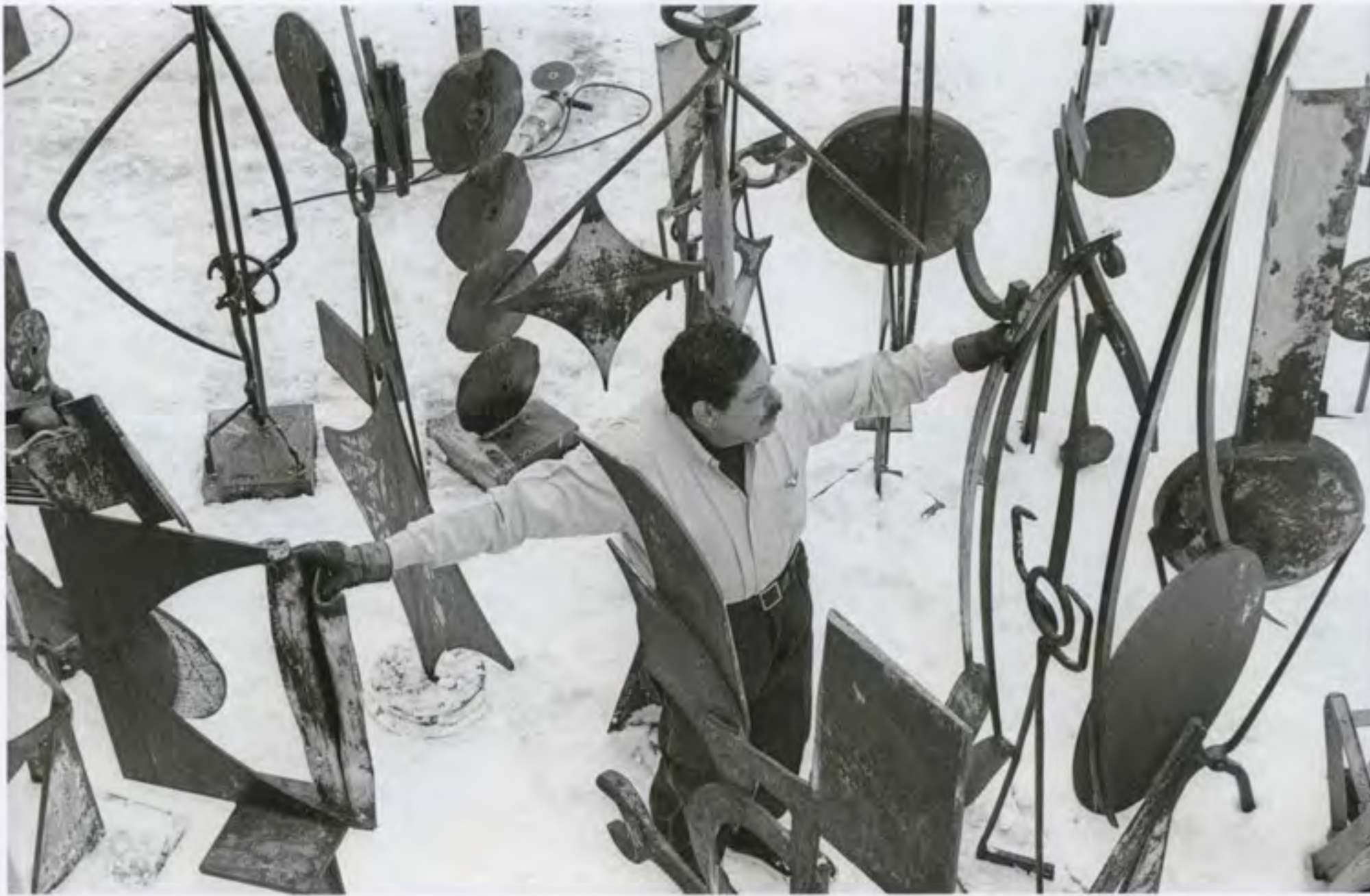
Figure 17 Smith with some of his sculptures, c. 1962–64.

The critic Peter Schjeldahl once commented to me that Bolton Landing was a cocktail party (fig. 17). This cartoonish image brings another quality of the work to our attention. I think of a wedding reception for two families—the Tanktotems and the Cubis —as they stand around the fields and pond of Bolton Landing on a summer afternoon. This image takes hold due to the totemic quality of Smith's abstract sculptures, which are modern and ancient simultaneously. The vertical organization of Smith's work begins or ends on the ground. The sculptures stand upright, creating an awareness that we