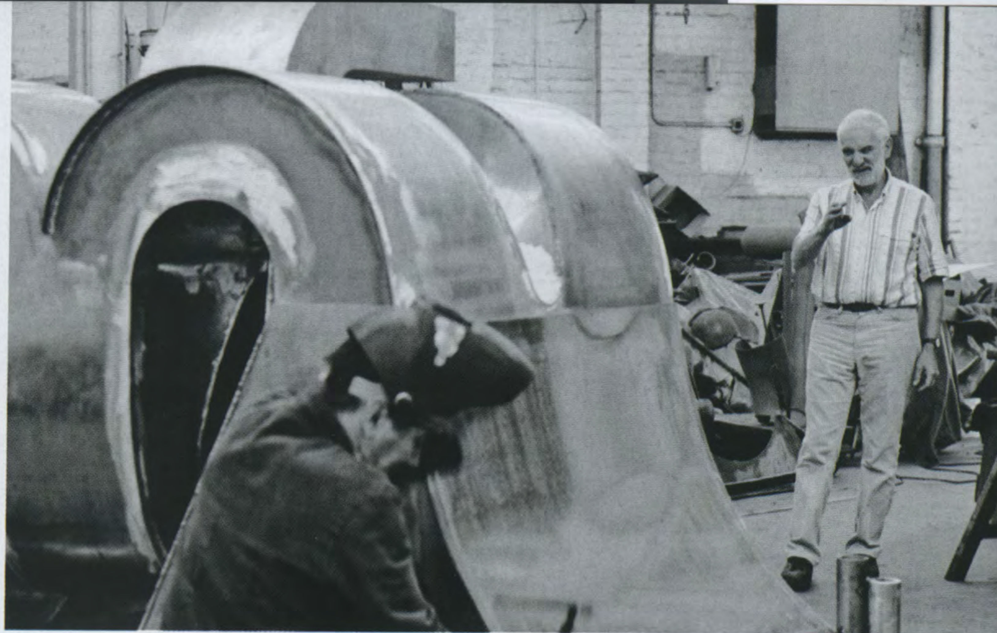
Anthony Caro working in his Camden Town studio, London, 1989.

made three long and intense visits to the gallery, and spent most of two days with Tony—who typically and frustratingly had no interest in listening to my unstinting praise of the sculptures, his entire mental focus being reserved, as always, for the pieces needing further attention.