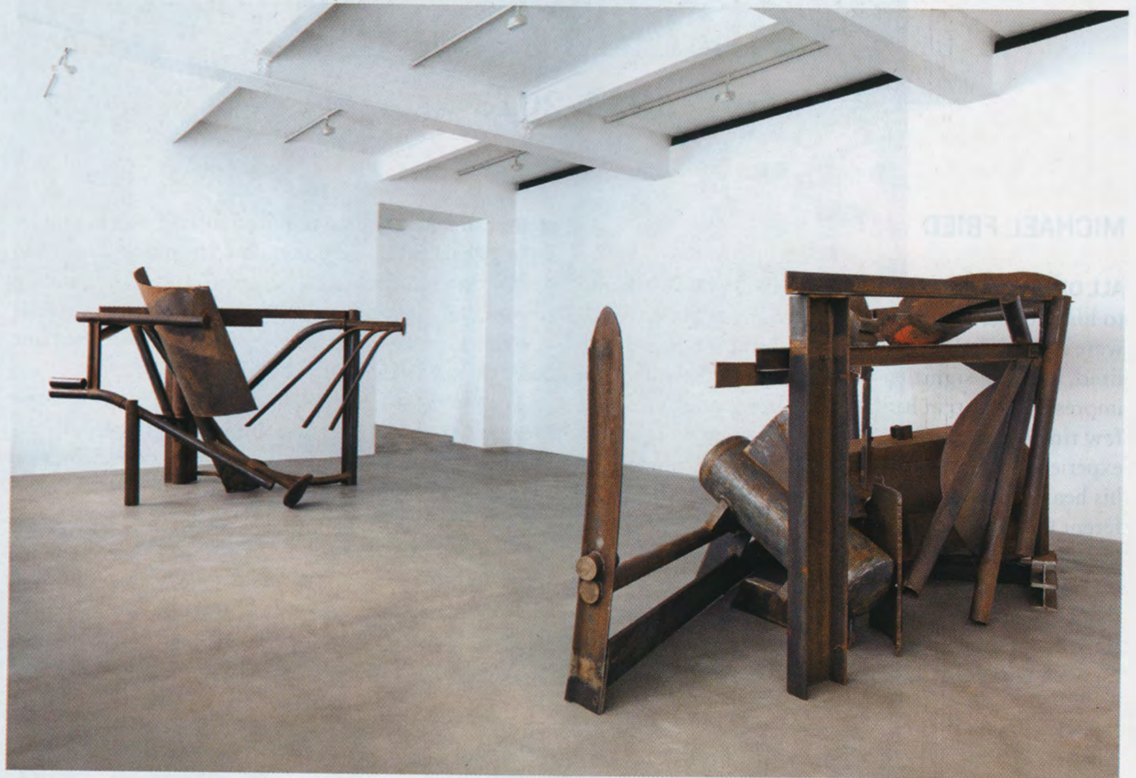
View of "Anthony Caro: Park Avenue Series," 2013, Gagosian Gallery, London. From left: Torrents, 2012; Clouds, 2012. Both from the series "Park Avenue," 2010–12.