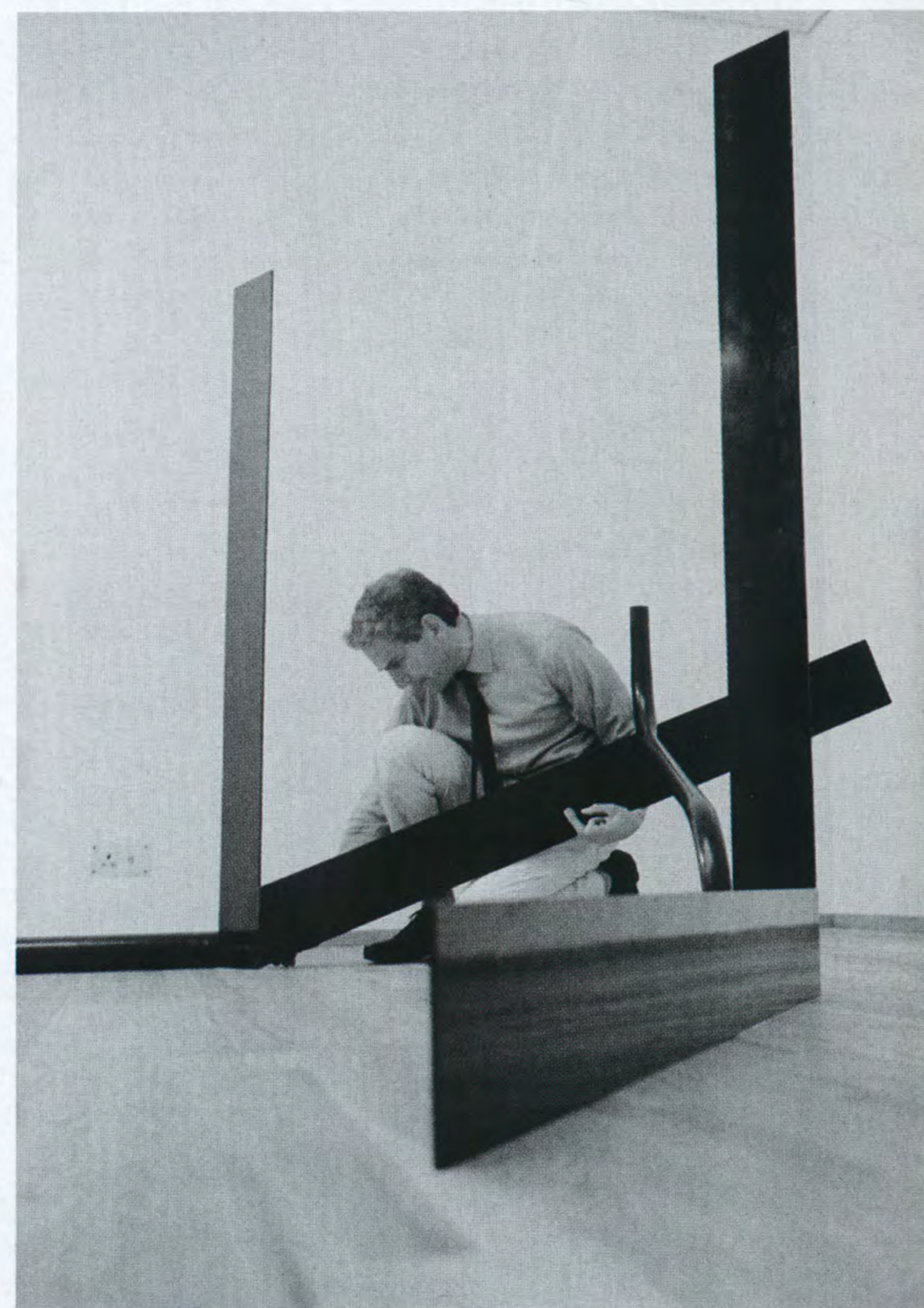
Anthony Caro, 1967.

Caro's solution and the deeper development of his sculptural thought is a breakthrough occurring at the beginning of the '60s, and it can be associated with that turbulent, exuberant decade. As an artist, he was in tune with currents outside his own immediate concerns. His willingness to abandon the familiarity of figuration and to begin working in a new genre with unfamiliar methods and materials produced work born alive in a time of change, however illusory the cultural and political transformations of that era may now seem. Caro abandoned the particular figurative genre associated with his artistic concerns and success. He then extended the very nature of another genre—constructivism—by altering the visual trajectory from which sculptures were viewed. Caro moves sculptural elements out laterally, often below eye