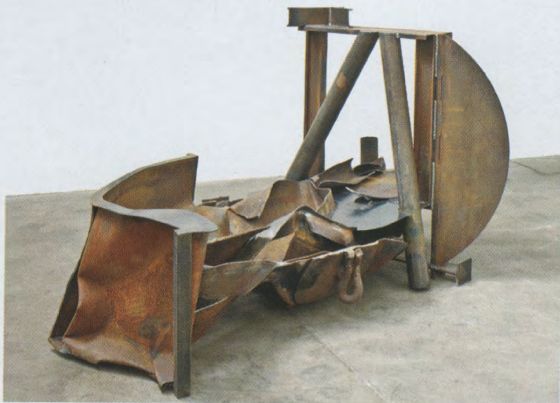
Anthony Caro, The Brook , 2012, rusted steel, 52% x 105% x 53%". From the series "Park Avenue," 2010–12.